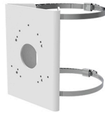
SN-CBK101A Pole Mount